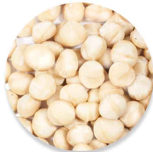
Style 1S (wholes, 13-16mm)