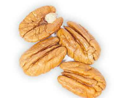
Extra Large Halves 351-450 count per pound 771-990 per kg