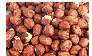
Roasted Natural Hazelnuts 11-13mm