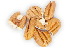
Mammoth Pieces over 9/16" —8/16" screen Over 14.3mm