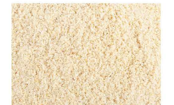
Hazelnut Powder <0.5mm