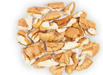
Medium Pieces Through 5/16" over 4/16" Through 7.9mm over 6.4mm