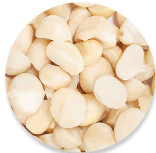
Style 2 (50% wholes, 13mm+)