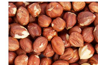
Roasted Natural Hazelnuts 13-15mm