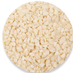
Style 6 (pieces, 5-9mm)