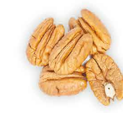
Topper Halves 651-800 count per pound 1431-1760 per kg