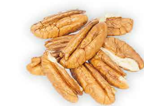
Extra Large Pieces Through 9/16" over 8/16" Through 14.3mm over 12.7mm