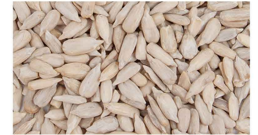
Sunflower seed kernels