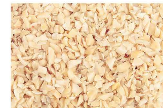
Hazelnut Pieces 3-5mm