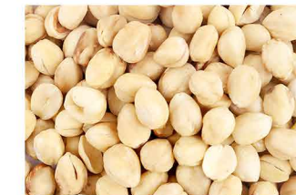
Blanched Hazelnut Kernels 11-13mm