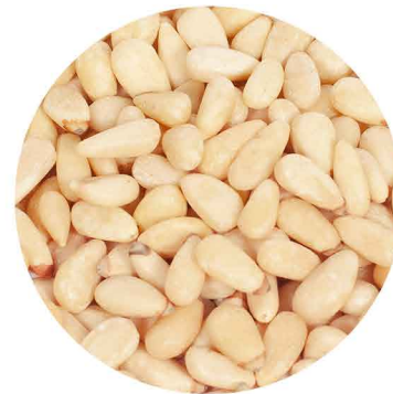
Red Pine Kernels 500-750 pcs/100g