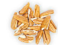
Large/Medium Pieces Through 6/16" over 5/16" Through 9.5mm over 7.9mm