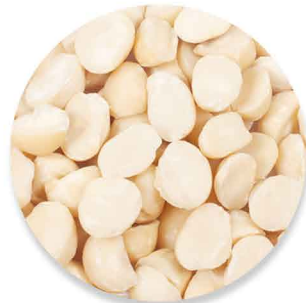
Style 4L (halves, 13mm+)