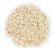
Meal Through 1/16" Through 1.6mm