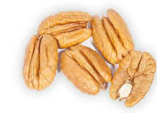
Medium Halves 551-650 count per pound 1201-1430 per kg