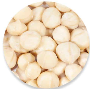
Style 0 (wholes, 20mm+)