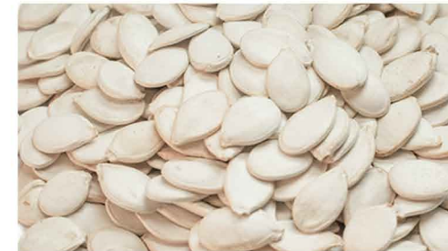
White pumpkin seeds