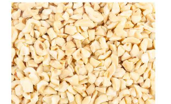
Diced Hazelnut Kernels 5-8mm