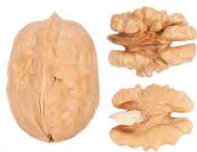
Xin 2 variety