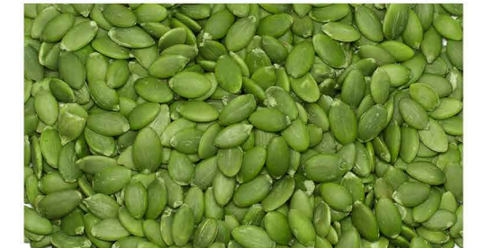
Pumpkin seed kernels