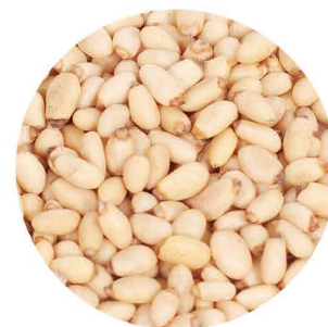
Huashan Pine Kernels 1800-2200 pcs/100g