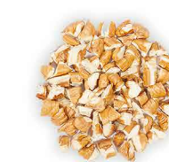
Midget Pieces Through 3/16" over 2/16" Through 4.8mm over 3.2mm