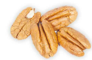
Mammoth Halves 200-250 count per pound 440-550 per kg