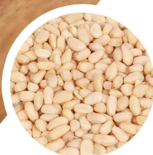
Cedar Pine Kernels 800-1200 pcs/100g