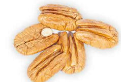
Large Halves 451-550 count per pound 991-1200 per kg