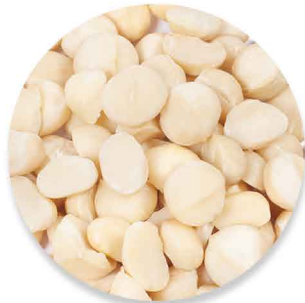
Style 3 (15% wholes, 13mm+)