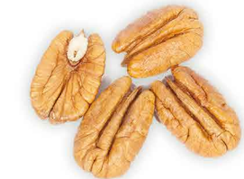
Junior Mammoth Halves 251-300 count per pound 551-660 per kg