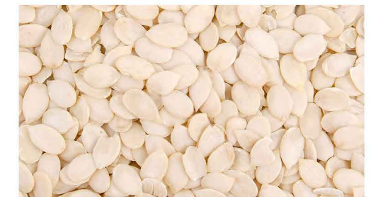
Watermelon seed kernels