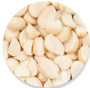
Style 4S (halves, 10-14mm)