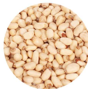
Yunnan Pine Kernels 850-1500 pcs/100g