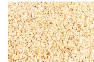
Hazelnut Pieces 1-3mm