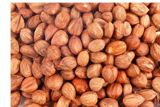
Raw Hazelnut Kernels 10-15mm