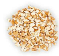
Granules Through 2/16" over 1/16" Through 3.2mm over 1.6mm