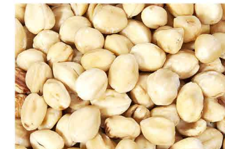
Blanched Hazelnut Kernels 13-15mm