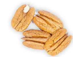
Jumbo Halves 301-350 count per pound 661-770 per kg