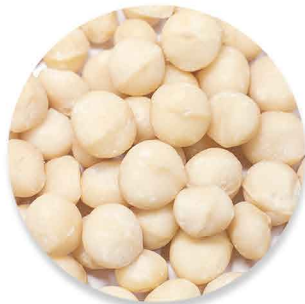
Style 1L (wholes, 16-20mm)