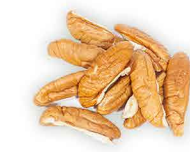
Large Pieces Through 8/16" over 6/16" Through 12.7mm over 9.5mm