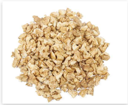
Small Pieces 4-8mm