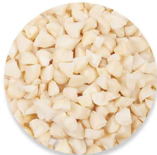
Style 5 (pieces, 8-12mm)