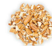
Small Pieces Through 4/16" over 3/16" Through 6.4mm over 4.8mm